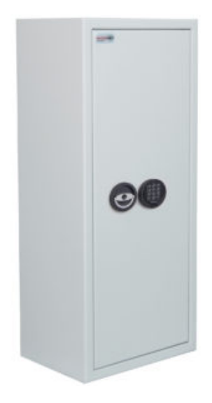
Secure Stor SC155