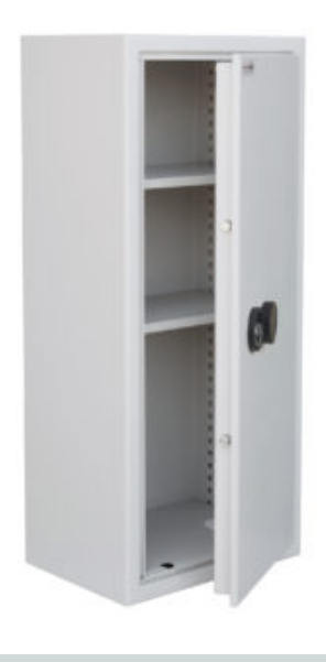
Secure Stor SC155 open